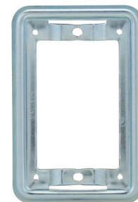
Adapter plate for mounting WLRS/WLRD covers to flush device boxes