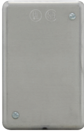
Blank cover for enclosing splices and taps where device not used