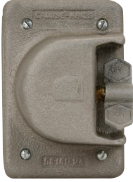
For general use snap switches; includes gasket