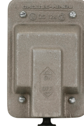
For general use snap switches; includes gasket