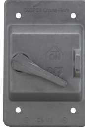
For general use snap switches; includes gasket