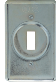
For square handle general use snap or toggle switches; unguarded