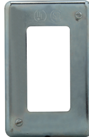
For GFI receptacles