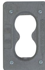
For standard and 3-pole, 2-wire grounding type duplex convenience receptacles; gasket included