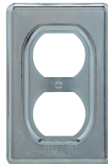
For duplex convenience receptacles