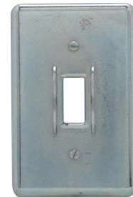
For square handle general use snap or toggle switches; guarded