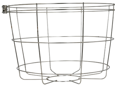
P23 – for use with reflectors