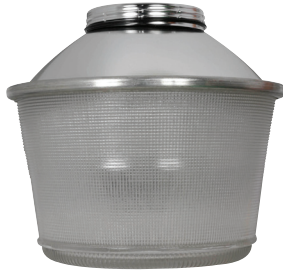
R2, R5, PR2, PR3, PR5