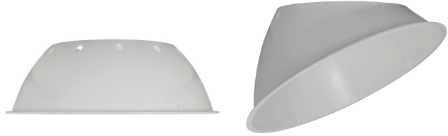
Dome – Krydon