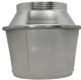
GR302, GR303, GR305