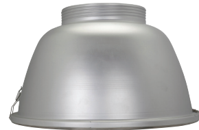
Etched Alzak aluminum reflector/tempered glass lens