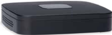
DNR214 4 Channels, 4 PoE+ Support, Max 8TB HDD