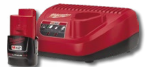
M12™ 2.0 Starter Kit (48-59-2420)

BUY TWO BARE TOOLS AND RECEIVE THIS FREE