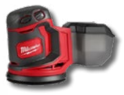
M18™ Random Orbit Sander - Bare Tool 2648-20 (2185489)