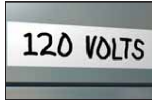
General Purpose Marking