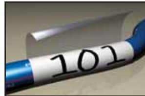
Wire and Cable Marking