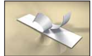
Easy-peel, split-back labels