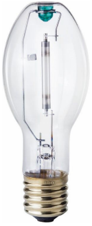
E39, ED-23 1/2, Clear