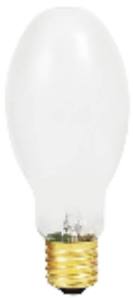
Ceramalx BF55 CO