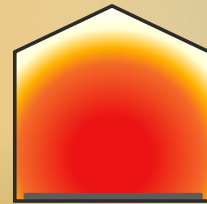
COMFORT AND SPACE HEATING

With a self regulated heated floor at 12W/sqft we reverse this situation by heating the interior of the bell and thus obtaining a very comfortable floor temperature in the 80°F range (26.7°C). This allows the room thermostat to be set as low as 65°F (18.3°C) while still providing higher comfort and a significant cost saving.