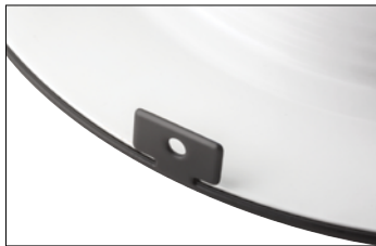
Pre-Install color finish trim insert over white 4" E Series Module.