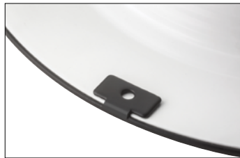
Press down color finish tabs for post-installation to create final LED 4" module.