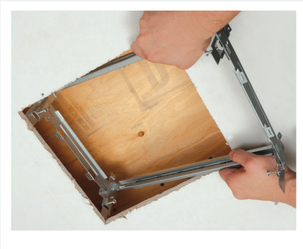
Single-Hinged Flex-Z Fast® Installation Bracket