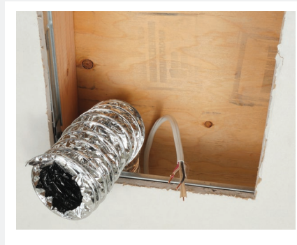
Existing 3" Duct and wiring