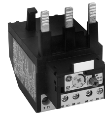
RT2 Overload Relay