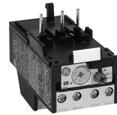
RT1 Overload Relay