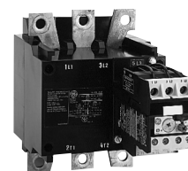
RT4 Overload Relay