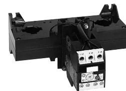
RT5 Overload Relay