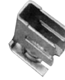
Quick Connector THQECC