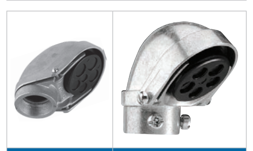
CIEFA-1/2 / CIEFA-4 CIEFSA-1/2 / CIEFSA-4