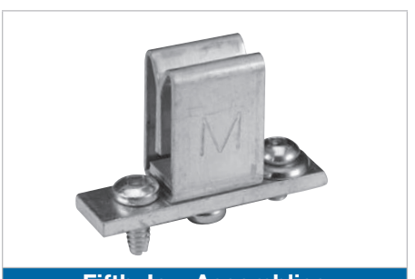
Fifth Jaw Assemblies