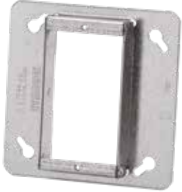
BC52C49-1/2 to CI52-C-51-2