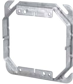
52 C 52 1/2 to 52 C 54 2