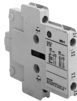
Side-Mount 600V Auxiliary Contact Block