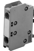
Front-Mount 600V Auxiliary Contact Block