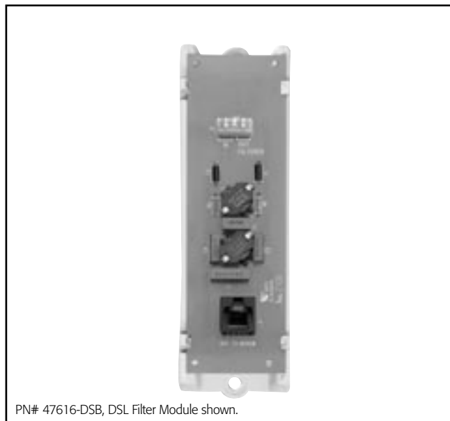
PN# 47616-DSB, DSL Filter Module shown.

See ELECTRONIC FILES for CAD files (.DXF, .DWG, MS-DOS.EPS) on disk