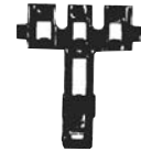
Movable Contact Support T-Bar