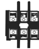
Cover for Movable Contacts