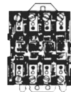
Molded Stationary Contact Support