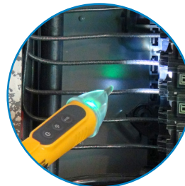
Detects AC voltage at panels