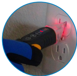
Detects AC voltage at outlets (including TR's w/61-657)