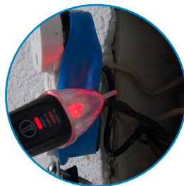
Detects AC voltage on conductors