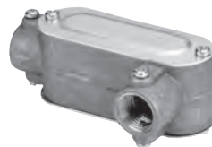
Supplied with 2 covers