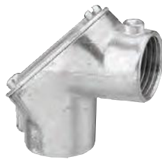
-G: with gasket