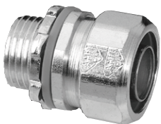
IT: with insulated throat