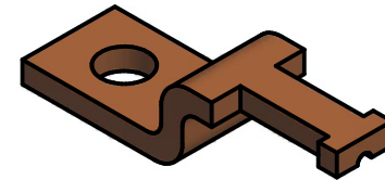
VIEW9 SCALE 2 : 1