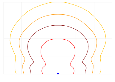
TWX3 LED ALO