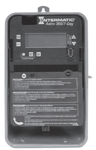
Shown in indoor/outdoor lockable metal enclosure

The time switch features an LCD and panel-mounted control buttons to set, review, and monitor the time switch functions, including setting date and time, schedule creation, enabling or disabling Daylight Saving Time (DST) and configuring DST switchover dates. Follow these instructions to complete the installation and programming of the ET2805 time switch.