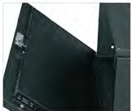
DLBX-FSK security cover kit prevents tampering with equipment while keeping airflow