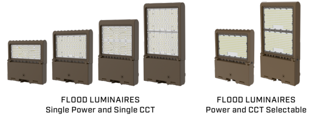
FLOOD LUMINAIRES Single Power and Single CCT

SELECTABLE COLOR TEMPERATURE (3 000/4 000/5 000 K) 1 POWER SELECTABLE 1