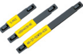
SMK2T series with SMOH holder