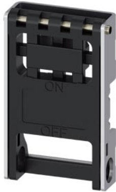
Padlock device for toggle handle accessory for: 3VA52/6VA61/3VA62