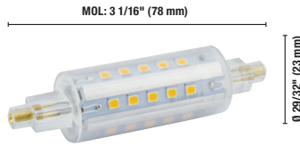
T3 - 78 mm