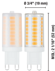
G9 4 W