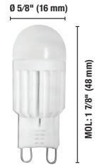
G9 3.5 W