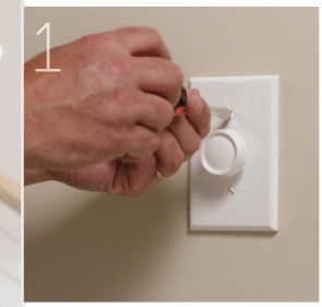
Turn off breaker