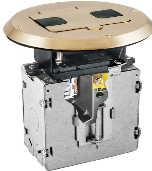
RF509BR, RJ650BKTR, RF500 with Divider

Note: Template cutout provided with instructions for proper installation.