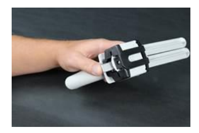
Lift Metal Tab

1. To assemble the dispensing tool, insert the piston. Rotate the black retaining collar forward. While lifting the metal tab, slide piston with ratchet teeth side down, into the slot through the front end. Push the piston all the way through and gently release the metal tab. The metal tab should catch on the ratchet teeth.