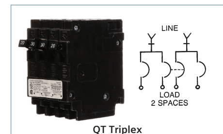
These space saver triplex breakers provide a 2-pole common trip breaker for 120/240V AC circuits and two single poles for 120V AC circuits. Triplex require two panel spaces. HACR rated.

These space saver duplex breakers combine two independent 1/2" breaker poles in a common unit. This unit plugs into one load center stab and requires one panel space. HACR rated.