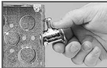
1. Simply snap into place. No locknuts required!

Simple, fast steps to install the Steel City® Cable Lok®.