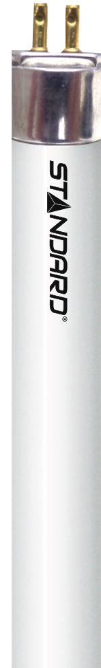
Nominal length : 22 in (559 mm) Dia. : 5/8 in. (16 mm)

Shape: T5 Base: G5 (Min Bipin) Starting method: Program Start (PS) Wattage (W): 14 Colour temperature (K): 4 100 CRI: 85 Rated life on PS/PRS 1 ballast: Based on a 3 hour start 25 000 Based on a 12 hour start 30 000 Initial lumens (lm): 1 350 Mean lumens (lm): 1 280 Nominal efficiency (lm/W): 96 TCLP compliant: Yes Phosphor composition: Triphosphor Nominal lamp operating frequency (Hz): 60 2 Minimum starting temperature (°C): -10