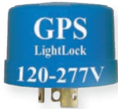
Twist-Lock Astronomical Timer 120-277VAC

Servicing controls is very expensive. Electricians perform hazardous work. They are well paid, as they should be. The retail price of GPS LightLock is a fraction of the cost of a single service trip charge to replace a photocell or re-program a timer. GPS LightLock now offers custom programming to meet your requirements stored in memory forever, and you still won't have to program a timer ever again. Still self-recovers from power outages and still requires no user programming, maintenance or even batteries!