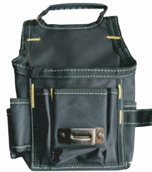
PAPA GRANDE Part# 43100