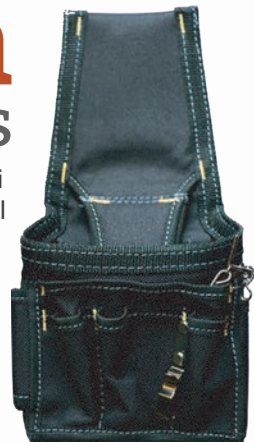
GRANDE Part# 43095