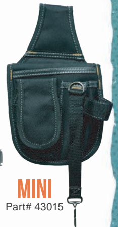
MINI Part# 43015