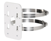
PFA152-E Pole Mount