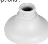
PFA106 Mount Adapter