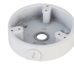
PFA137 Junction Box