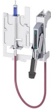
MAX-FLEX KIT HANDLE, CABLE, BREAKER OPERATOR ACCESSORY FOR: 3VA5/6 400/600