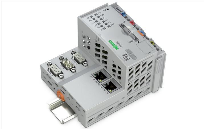
Color: ■ light gray