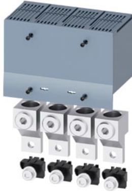
Wire connector TA2.2 2 AWG...350 kcmil large 4 units accessories for: 3VA5 250