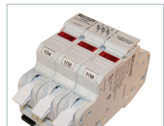
WMB Marker System