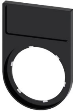
Label holder, 22mm, flat, Frame rounded off at the bottom black, for labeling plate 12.5 mm x 27 mm, for gluing