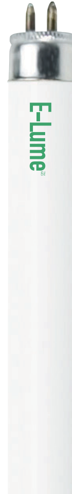
Nominal length : 46 in. (1 168 mm) Dia. : 5/8 in. (16 mm)

Shape: T5 Base: G5 (Min Bipin) Starting method: Program Start (PS) Wattage (W): 54 Colour temperature (K): 4 100 CRI: 85 Rated life on PS/PRS 1 ballast: Based on a 3 hour start 30 000 Based on a 12 hour start 40 000 Initial lumens (lm): 5 000 Mean lumens (lm): 4 683 Nominal efficiency (lm/W): 93 TCLP compliant: Yes Phosphor composition: Triphosphor Nominal lamp operating frequency (Hz): 60 2 Minimum starting temperature (°C): -10