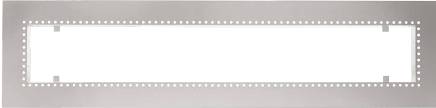
18-2305 W-61 Flush Mount Frame