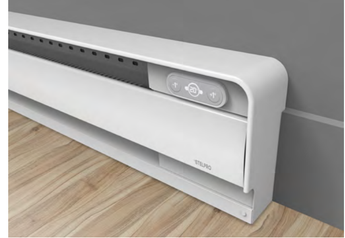
SIBTx - MECHANICAL