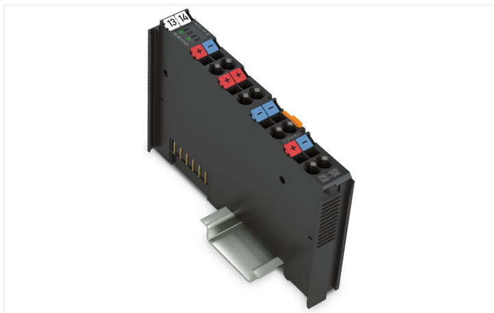
Color: ■ dark gray