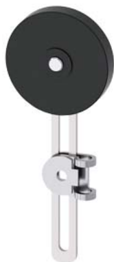
Adjustable-length Twist lever for position switch 3SE51/52 Metal lever 100 mm long Rubber roller 50 mm