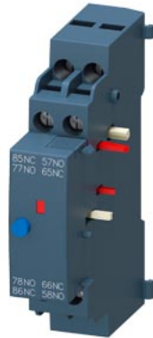
signaling switch for circuit breaker 3RV2 with screw terminal