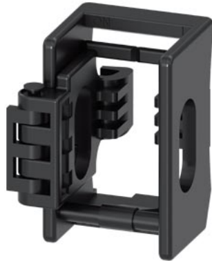
locking provision for handle accessory for: 3VA51